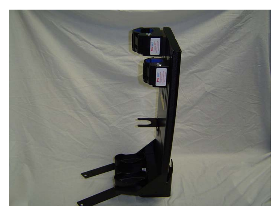
G7252 VERTICAL GUN RACK WITH MOUNT

This instruction sheet is for Impala Police Cruiser applications only.