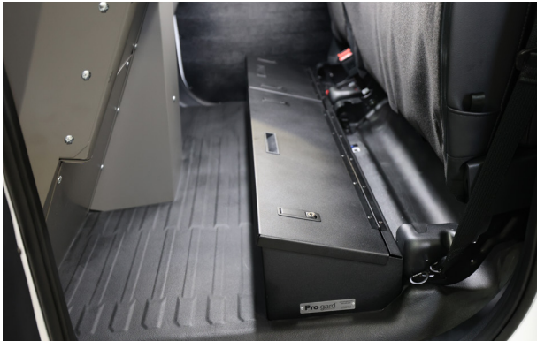
Large and small compartments feature two locking latches each for maximum security.