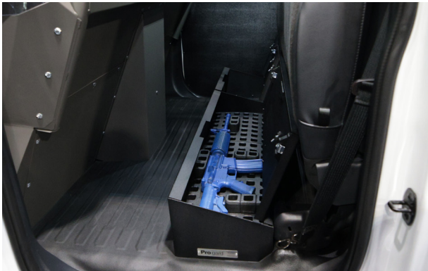
Large compartment featuring optional Magpul® DAKA® Grid Organizer.