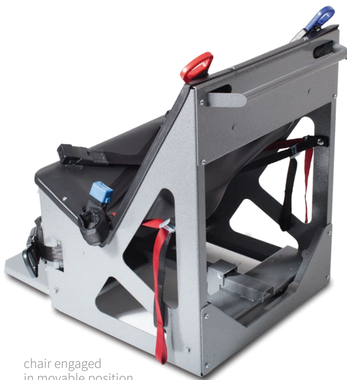
chair engaged in movable position