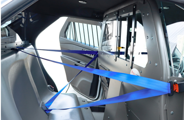
Retractable OSB's shown in the 2020 Ford Police Interceptor Utility