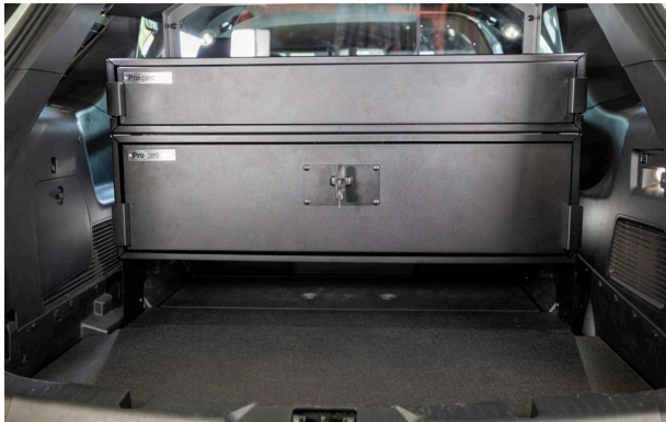
Ford Utility - Stacked Cargo Storage Drawers free standing.