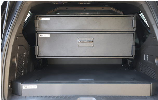
Chevy Tahoe - Stacked Cargo Storage Drawers mounted to Cargo Storage Floor.