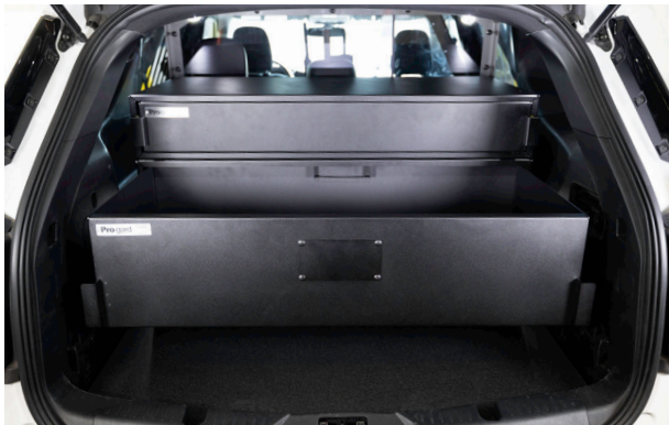
Ford Utility - Stacked Cargo Storage Drawers featuring no lock.

Introducing Pro-gard's Cargo Storage Drawers, available in Large and Small sizes. These drawers transform cargo management for law enforcement, providing expanded storage for weapons, equipment, and gear. Crafted from durable lightweight aluminum, these drawers feature a textured black powder coat finish, stackable design, locking slides, and a protective rubber mat. Hassle-free no holes drilled installation attaches securely to OEM holes with no assembly required. Elevate your storage capabilities effortlessly with Pro-gard's Cargo Storage Drawers.